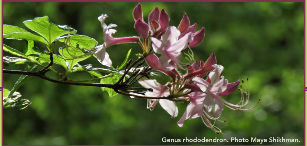
Genus rhododendron.