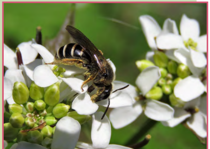
Top: Common snowdrops - found at Blue Heron Park. Bottom: Orange-legged furrow bee.

Some outdoor programs take place at locations other than Blue Heron Park. Locations are indicated in program descriptions.