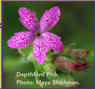
Depthford Pink.