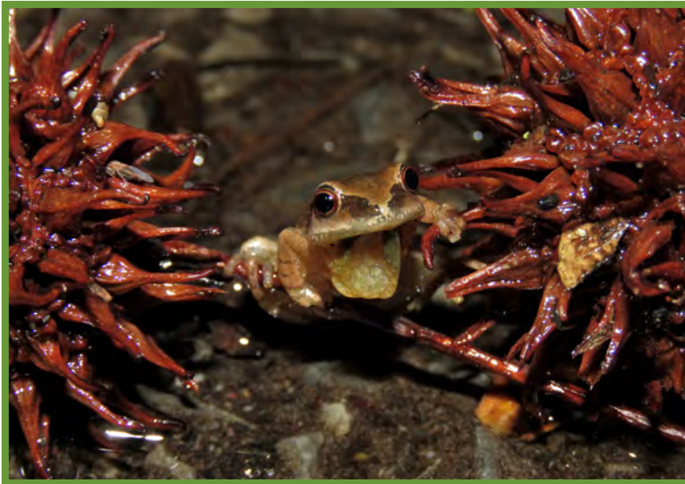
SPRING PEEPERS

MEMBERSHIP BECOME A MEMBER OR RENEW YOUR MEMBERSHIP