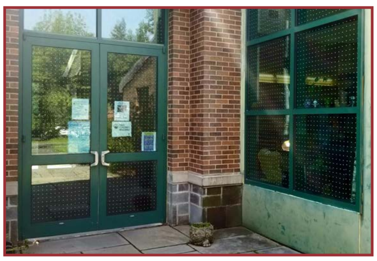
Window dots installed on the windows of the Nature Center.